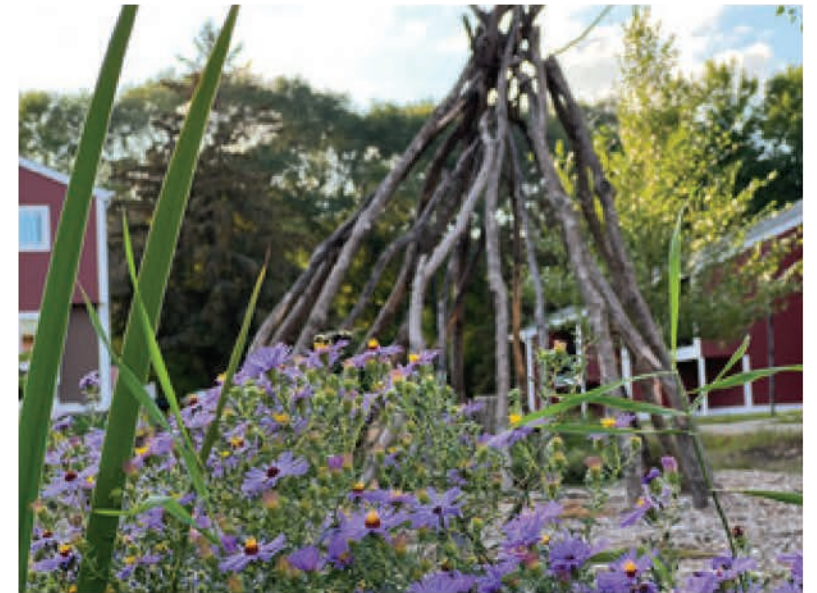
Brook Gardens, Brooklyn Park: bee-friendly aster, stick trellis in nature play area