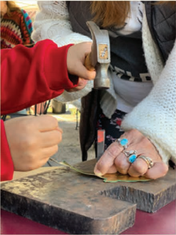
Volunteers making pollinator-themed art, 38th Street, Minneapolis