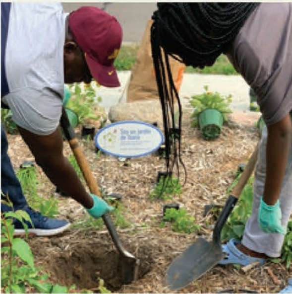
Community planting day, All Nations Church, Minneapolis