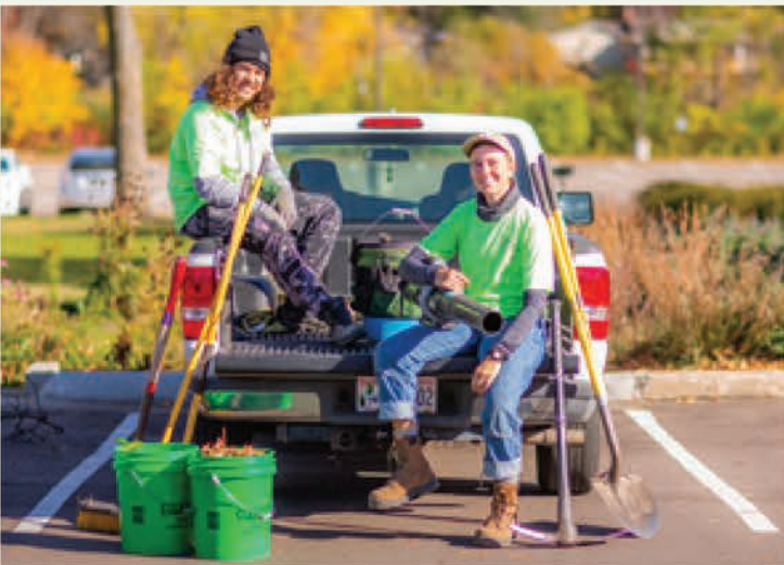
Design + Build crew members