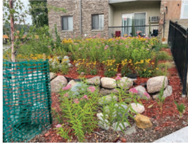
Autumn Ridge Apartments received the City of Brooklyn Park's 2021 Summer Blossom Award