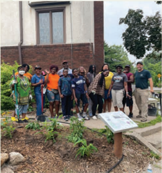
16 volunteers turned out for the All Nations Church community planting day

"I'm learning to appreciate native plants, like plants that attract bees and what the bees do for the earth... that's the knowledge I'm trying to pass down to the kids, to let them know how important these things are to our environment."