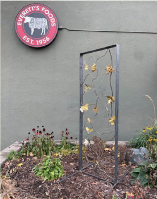
Pollinator art sculpture in pollinator garden, 38th Street, Minneapolis