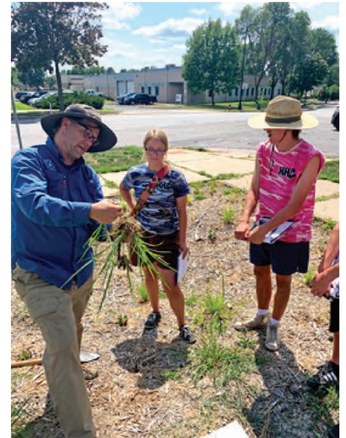
All about plant roots

We're growing a green infrastructure workforce and creating job and education pathways in the environmental field, especially in communities that lack quality training programs. After a pandemic hiatus in 2020, we revamped our training to add an online learning element. We provided training to 101 youths and young adults.