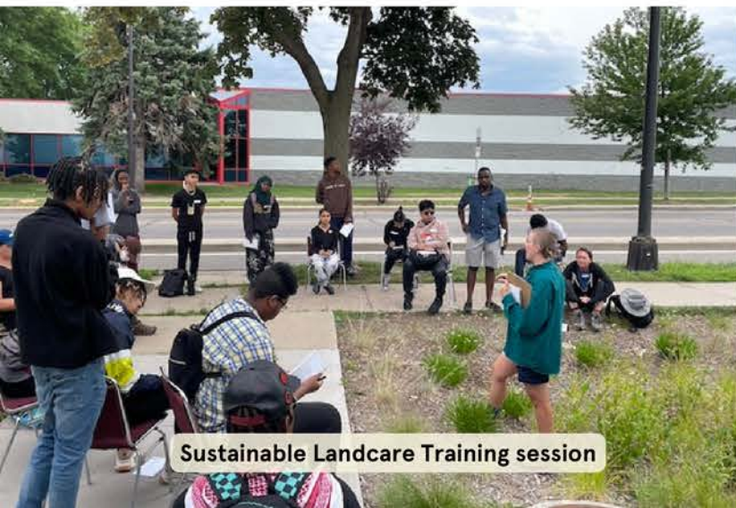
Sustainable Landcare Training session

Our Design+Build team has a well-developed program in sustainable landcare of commercial-scale properties, with expertise in stormwater practices and care of native plants. Staff draw on real-world field experience to teach SLC participants and workshop attendees. They also mentor interns.