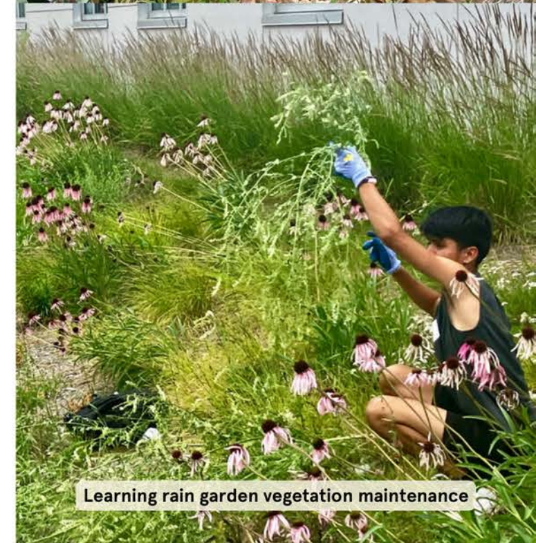
Learning rain garden vegetation maintenance