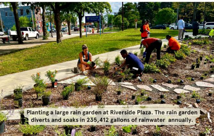
Planting a large rain garden at Riverside Plaza. The rain garden diverts and soaks in 235,412 gallons of rainwater annually.

Over several years, we've installed three large rain gardens at Riverside Plaza, a large rental complex in Cedar-Riverside, Minneapolis. The rain gardens help keep the nearby Mississippi River clean. In response to community input, in 2023 we completed a small park where residents can sit outside in nature in the heart of their city neighborhood. Residents were paid for their help at two paid planting events.