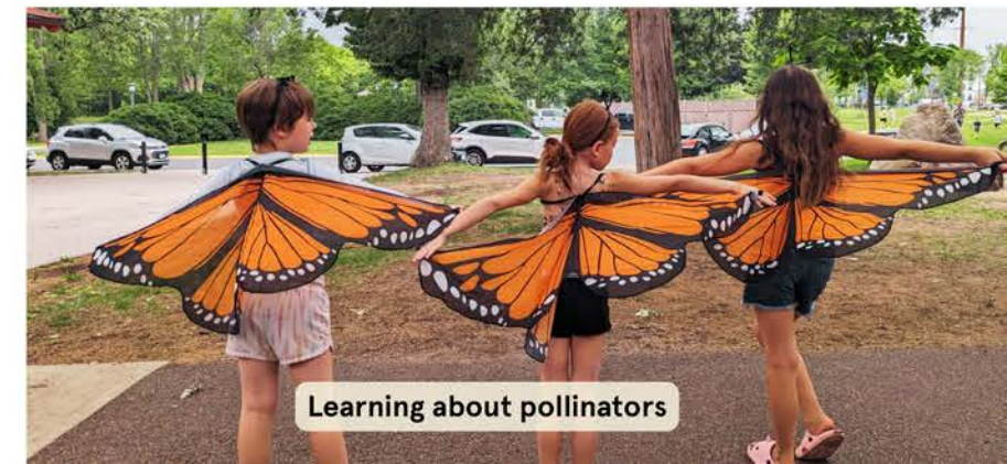
Learning about pollinators