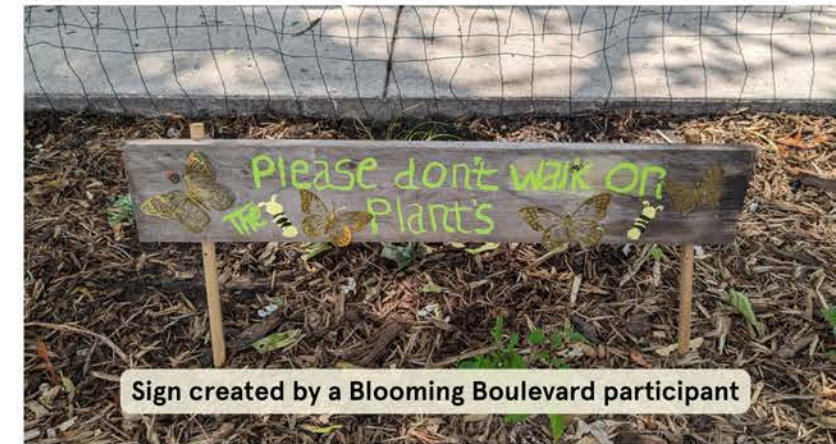
Sign created by a Blooming Boulevard participant