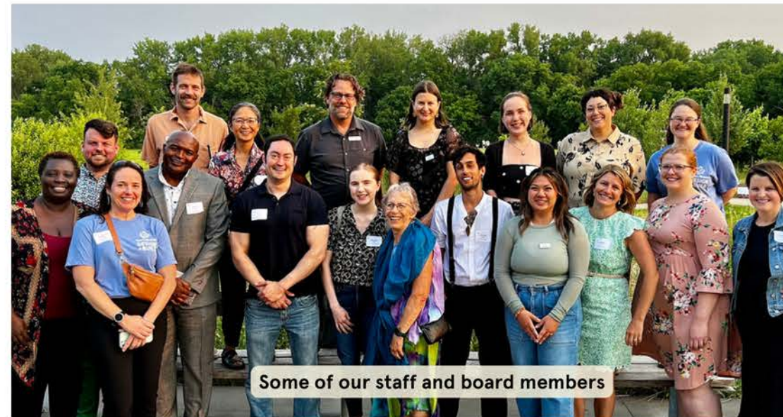
Some of our staff and board members