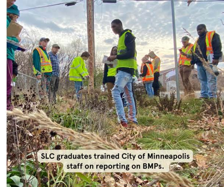
SLC graduates trained City of Minneapolis staff on reporting on BMPs.