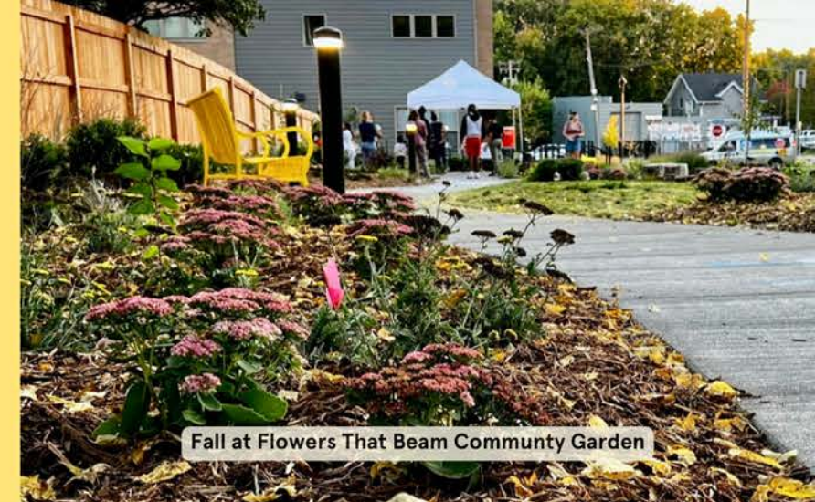
Fall at Flowers That Beam Community Garden