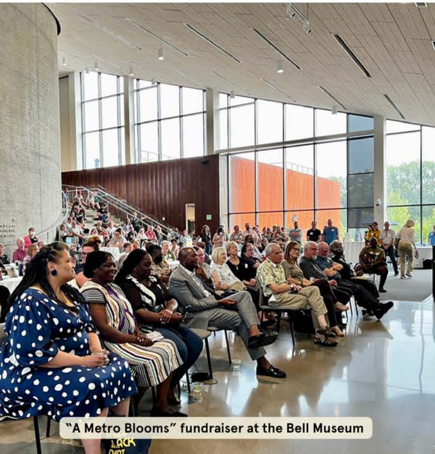
"A Metro Blooms" fundraiser at the Bell Museum